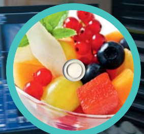
Top Class Printing