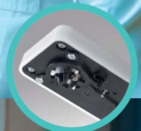
Trouble Free Operation