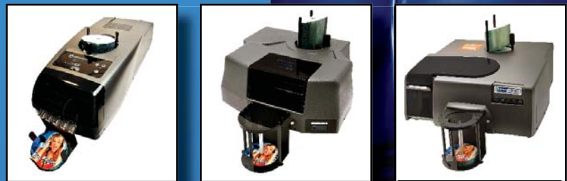
PrintWrite is designed for use with Microboards' GX Disc Publisher (left), CX-1 (center), and MX-1 and MX-2 (right)