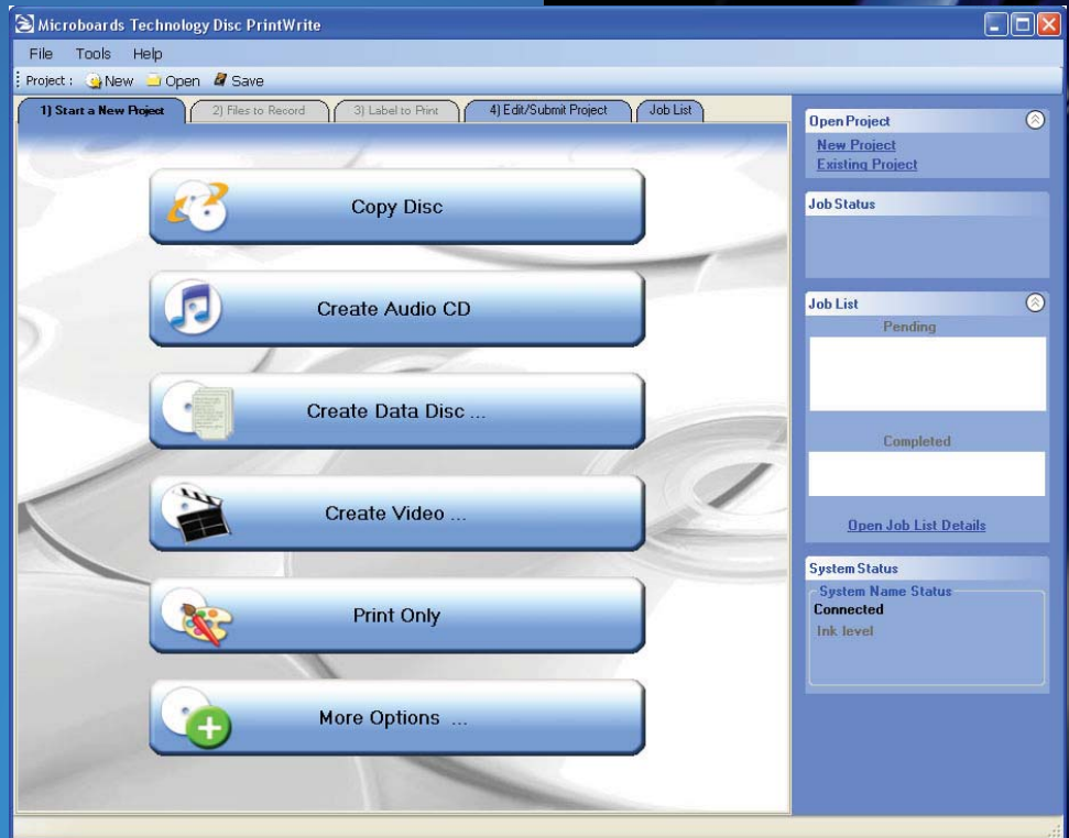
The six main options from the opening screen.